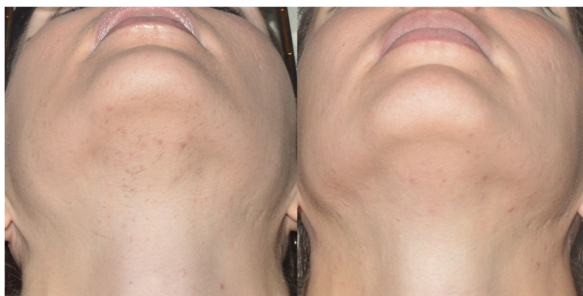
Fig. 3 A 29-year-old woman with Fitzpatrick skin type III who underwent treatment of unwanted hair in the face at a baseline and b 3-month follow-up after four treatments with 755-nm alexandrite laser Motus AX and Moveo technology, DEKA., Calenzano, Italy

There are several limitations of this study: absence of control group, evaluation only the short term results of the hair removal treatment, and the method of assessment of hair counts. Hair counting by means of digital photographs could make possible that thin hairs after laser treatment were not noticed by assessors on the digital photographs, and thus, the percentage of hair reduction was higher.